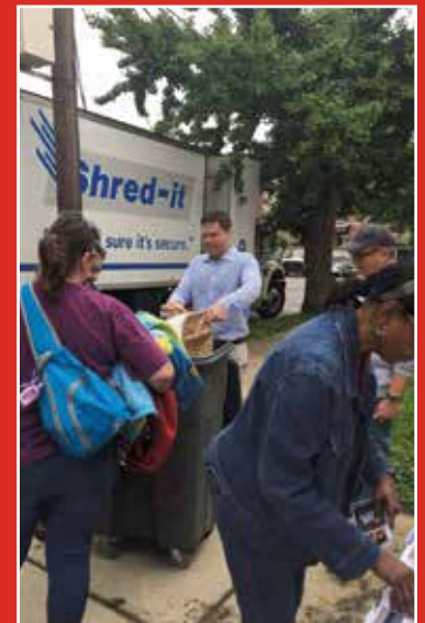
Rep. Solomon helps constituents protect their identity at a free shredding event, May 20, 2017.