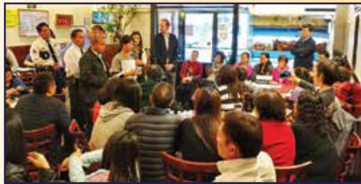
Rep. Solomon's staff, along with local and state law enforcement, address public safety concerns in the Asian Community, October 29, 2017.