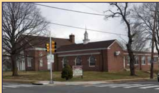
The historic Parish House complex at 6901 Rising Sun Avenue